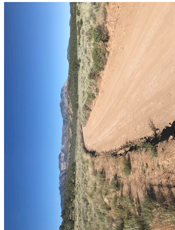
Utah State Office